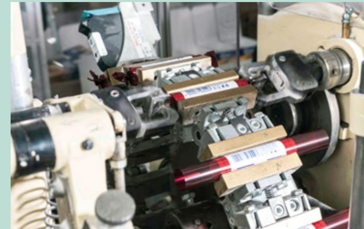
Roll packing machine