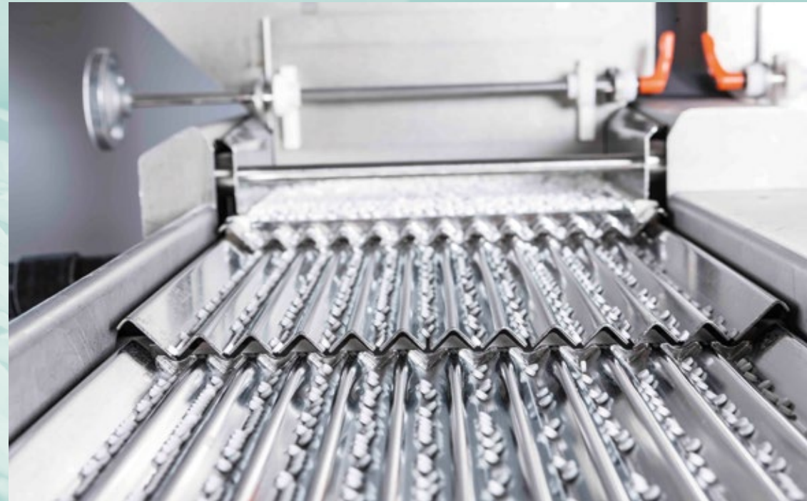
Canning Tablet packaging