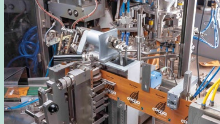
Modern bag packing machine