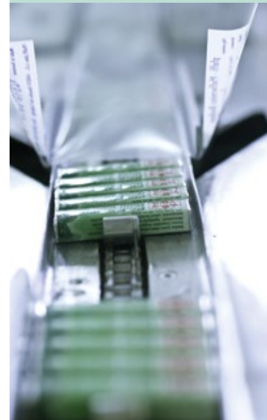
Bar packing machine