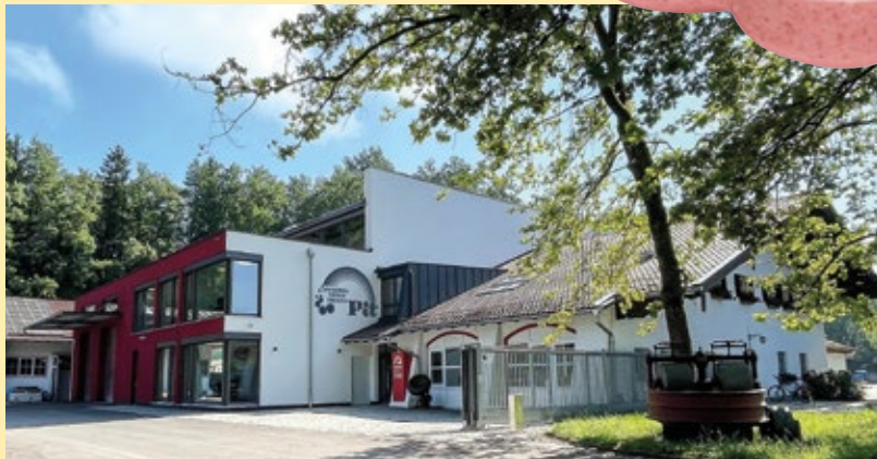
2020 extension of the office space with a modern new building.