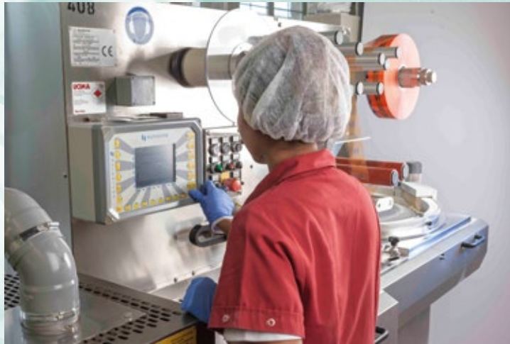
Flow pack packaging